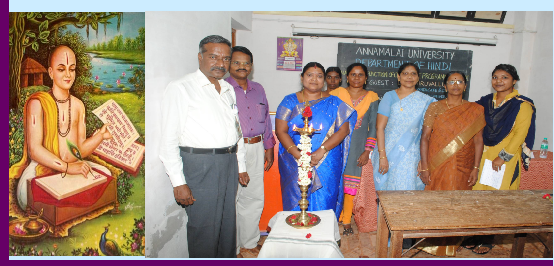
Department of Hindi

The department was established in 1972 to impart Hindi language skills for better employment opportunities. Hindi was offered as a second language in the beginning and in due course a PG Diploma in translation was started and later on evolved into M.A. Hindi program from 2000 onwards. So far the department has produced 14 M.Phil. and 13 Ph.D. scholars who are placed in different positions all over India with 100% placement. The students of the department translated renowned Tamil and English works into Hindi. Two software programmes produced by the faculty stands as testimony for relevant research output in the field of language technology. Translation studies, Comparative studies and Language technology are the thrust areas of research.